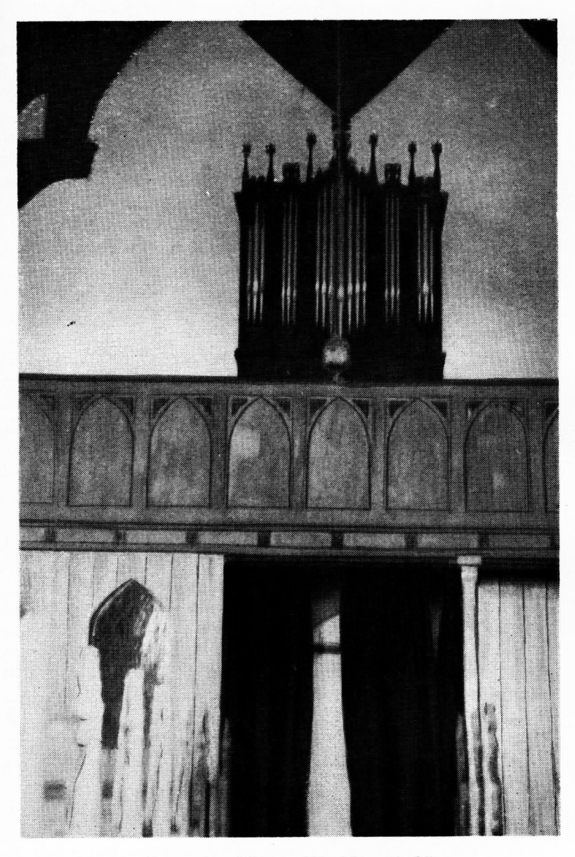
FIG. 1. Barrel-Organ at Woodrising, Norfolk.